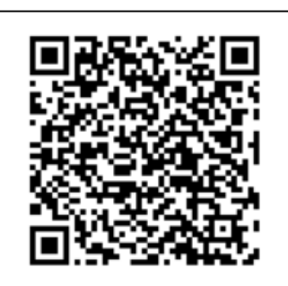
QR Code for session 16629